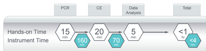
Figure 1. AmplideX PCR/CE CFTR Kit* workflow.